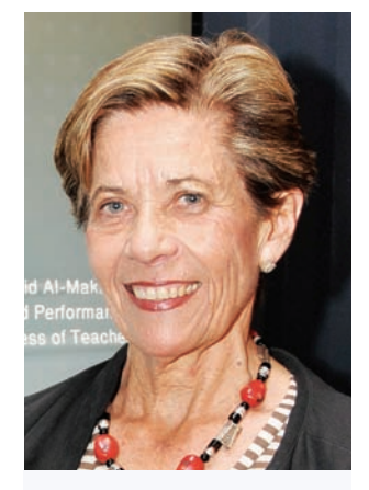
Bevan: The Prize brings peoples together and reflects a beautiful image of Arabs and their interest in education